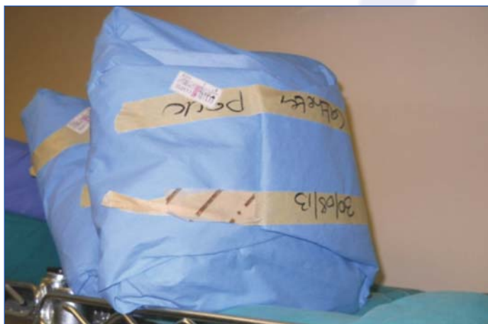
Example of manual batch label

The staff in the operating theatres at Southern Health in Australia discovered an item packed in a SteriReel (paper plastic pouch) where the external and internal chemical indicators had not changed colour. It appeared the item had been cleaned and packed but not sterilized. The hospital used a manual track and trace system so the item had a batch label. Having noticed this breach a recall of all items with the same batch number was initiated.