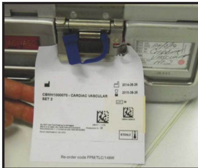
Example of a barcode

The use of an electronic track-and-trace system would facilitate the capturing of data at each point of the decontamination cycle allowing the hospital to easily track, trace and record each step of the decontamination process. Because so much data is recorded throughout the process an electronic track-and-trace system would help a hospital to better manage their assets, to measure and improve staff productivity, identify staff training needs, improve their compliance and ensure patient safety! The data recording is facilitated by marking each set with a unique barcode, by having workstations and scanners at each point of decontamination, and by having individual staff logins.