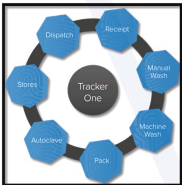
The FingerPrint Tracker System for example records data at each of these points