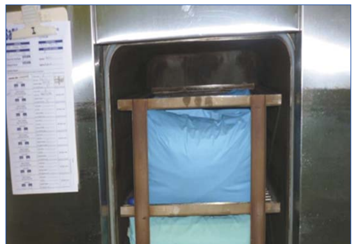
SafMed Documentation Envelope: Manual Track-and-Trace System

Many hospitals in a number of countries have implemented medical device track and trace systems. In fact in many countries like Japan, Ireland and the UK implementation is mandatory.