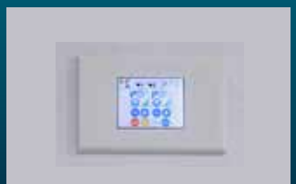
From the wall mounted touch screen