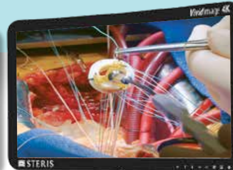
4 500 K Ra=95 / R9=97