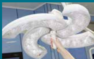
Control the pattern diameter from the sterilisable handle