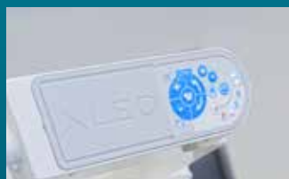
From the light head