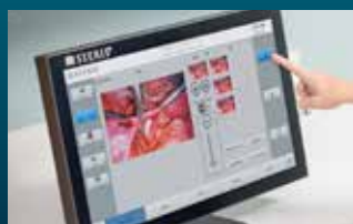
From the Harmony iQ™ integration systems

Integrate the image, transform your operating room.