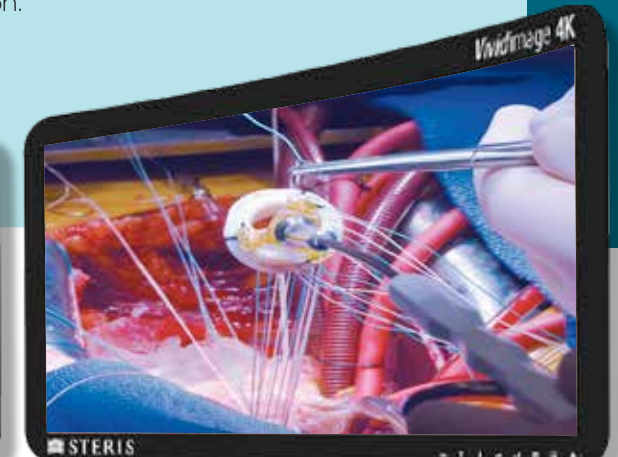
5 000 K Ra=95 / R9=97

Homogeneous and constant quality of light across the different colour temperatures and over time.