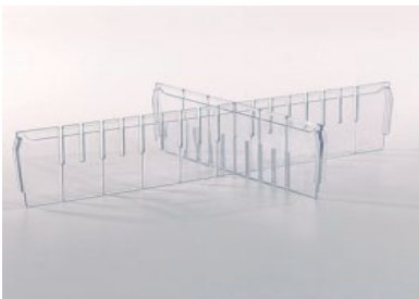
Plastic Long & Short Dividers