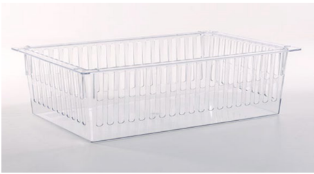
Plastic Basket with open base & sides

The PC modules constitute the basis of the logistical system. They are used to store and transport medication and goods and are interchangeable between storage systems, and transport carts.