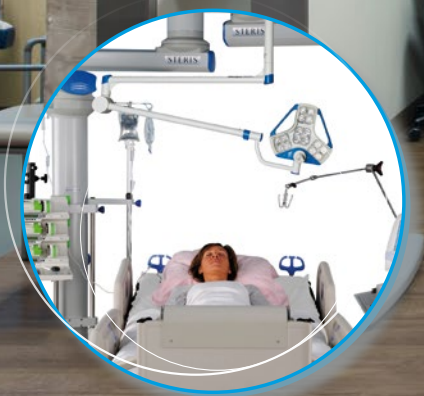
Intensive care units