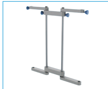
Quad support for infusion rack for distribution column Ref : SUP 41