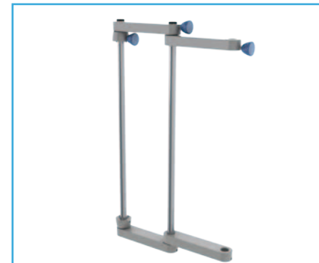
Triple support for infusion rack for distribution module Ref : SUP 32