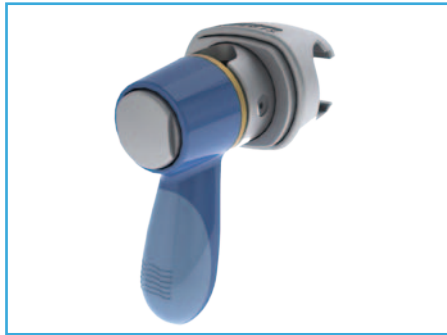
Rail-infusion rack clamp Ref : TAB 741